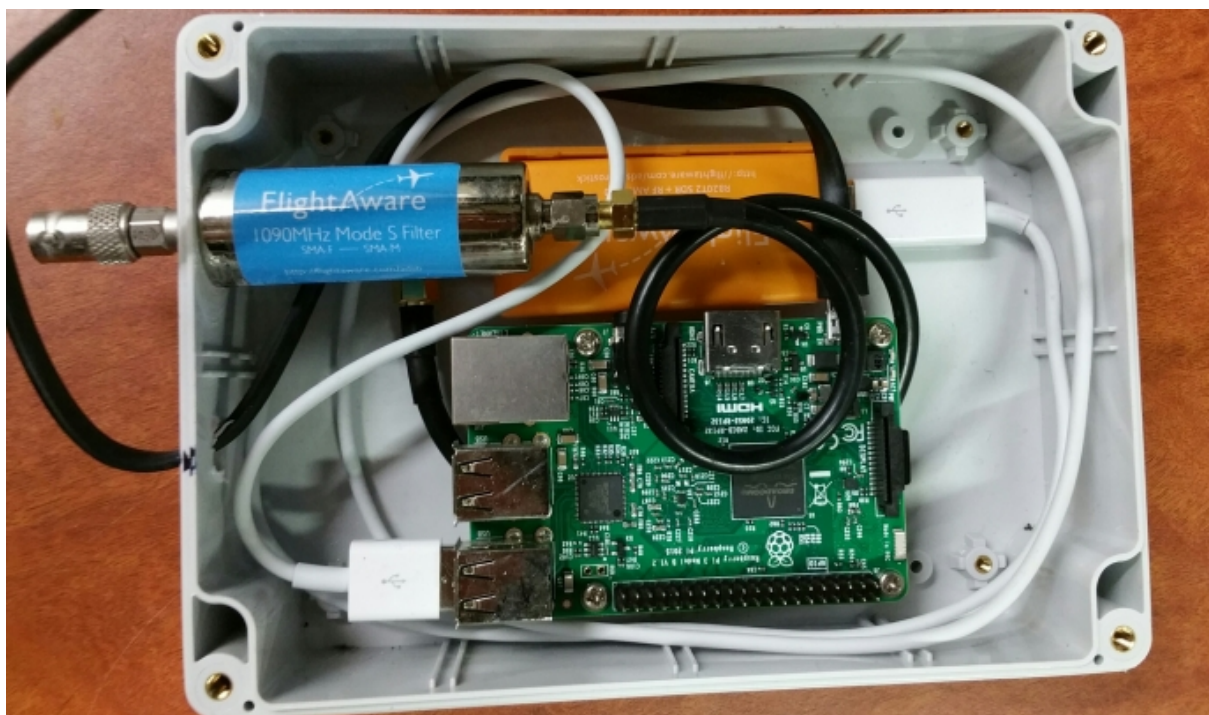
VK4TEC ADSB receiver planned for the VK4RRC site