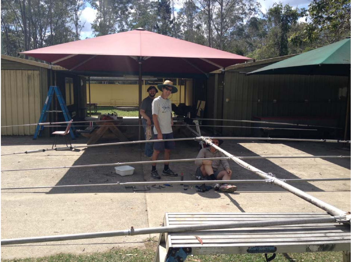
BP Park antenna work