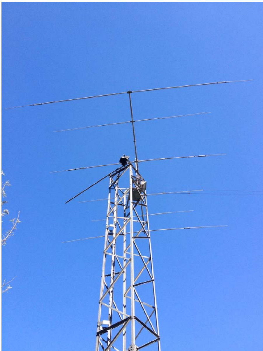
TH6 antenna refurbished last weekend